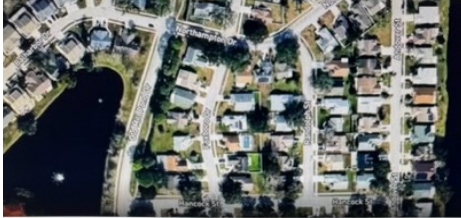
Millpond Estates Community Section One (Photo group: 19 members)

I hope you all enjoyed the St Patrick's Day event that was held in the clubhouse. Lots of events coming up in the months ahead. Remember to sign up in the clubhouse for those required events.